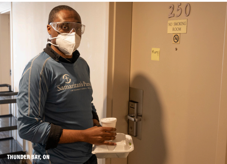
THUNDER BAY, ON