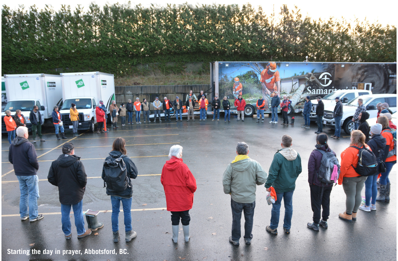
Starting the day in prayer, Abbotsford, BC.