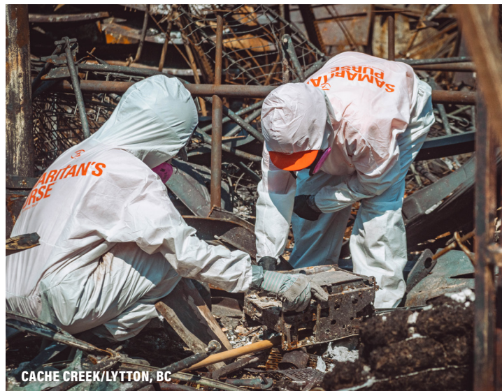
CACHE CREEK/LYTTON, BC